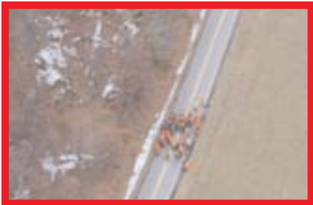
One of CAP's Search & Rescue Teams, seen gathering before advancing their search, up and then down the mountainous area to the left.