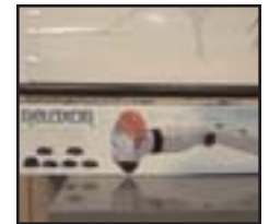
Relaxer Massager with Heat