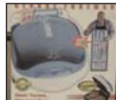
George Foreman "Champ Size" Grill