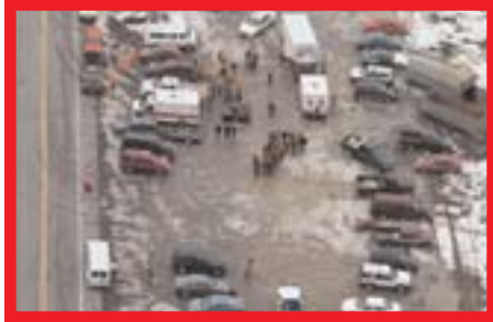
Photo of Mission Base from the flight crew's ariel view, during the search for missing Bedford youth.