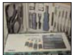
41 Piece Travel Socket Set & General Tool Set