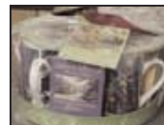
Thomas Kinkade Beverage Quartet